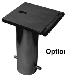
Optional Ground Socket for Removable Bollard version