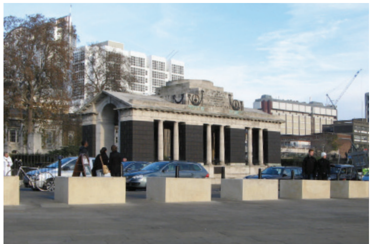
The CT Block sits only 100mm below surface