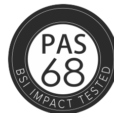
CT BLOCK (WITH GUNWHARF PLANTER) BLOCK PAVING INSTALLATION