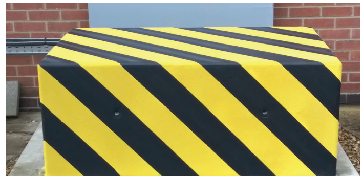
The CT Block sits only 100mm below surface