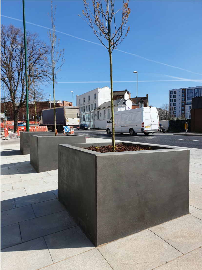
Townscape Extra Large CT Block Planters