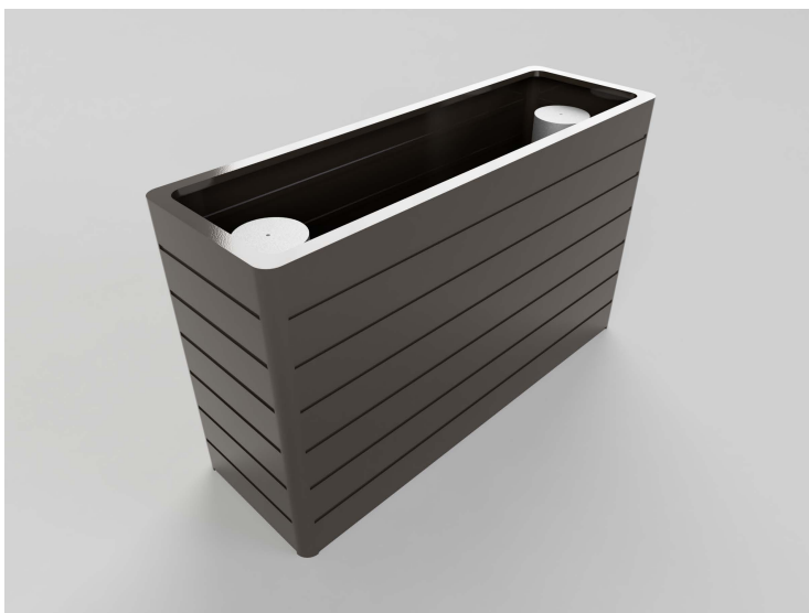
VICTORIA PAS 68 PLANTER VED 0062 - FOUNDATION FOOTPRINT 3838 mm (L) x 600 mm (W) x 600 mm (D)