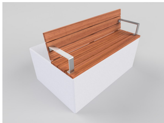
VED/0044HB1 CT Block Seat Top Sapele Timber