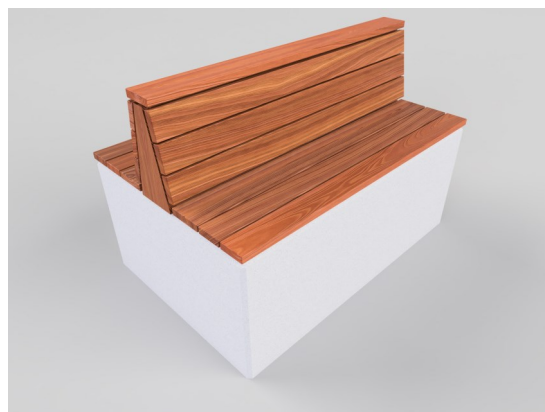
VED/0044150FB CT Block Seat Top Sapele Timber (Option with Armrests is available)