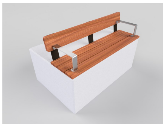
VED/0044HB2 CT Block Seat Top Sapele Timber