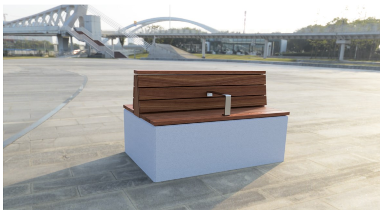
VED/0044150FB CT Block Seat Top Sapele Timber with single Armrest