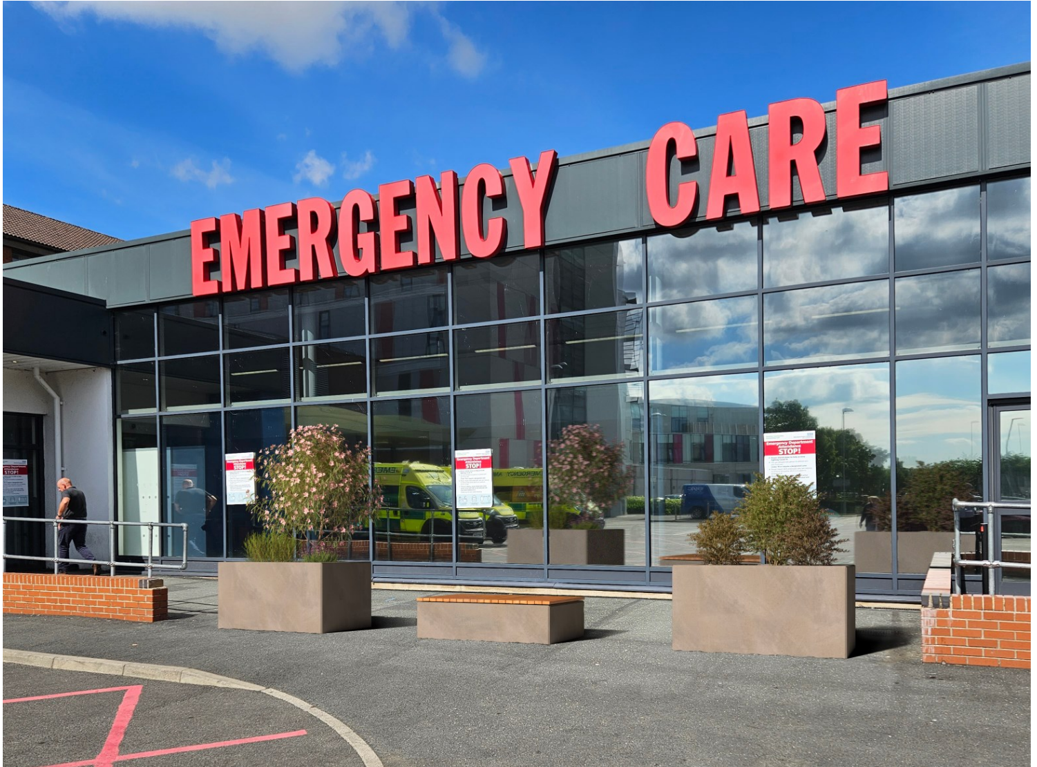
Townscape CT Block Planters with CT Block Deck Seat

For more information about any aspect of this product please call the Townscape Sales Office on +44 (0) 1623 513355