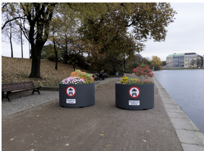
PLT/0201FLT RAL7021 with Forklift Pockets