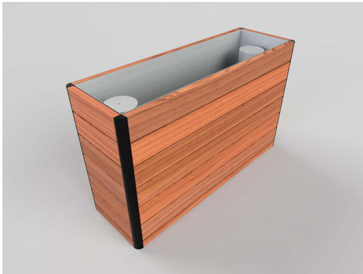
TOLEDO PAS 68 PLANTER VED 0190TS - FOUNDATION FOOTPRINT FOOTPRINT 5000 mm (L) x 2500 mm (W) x 600 mm (D)

Please contact the Sales Office for Sample finishes