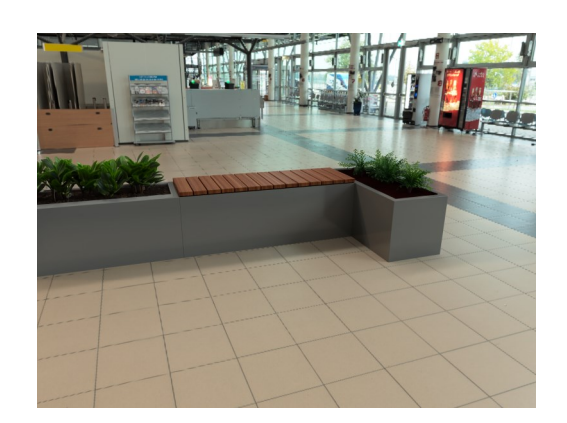
STG/1802 Townscape Lite Seat x2 Townscape Mild Steel Planter