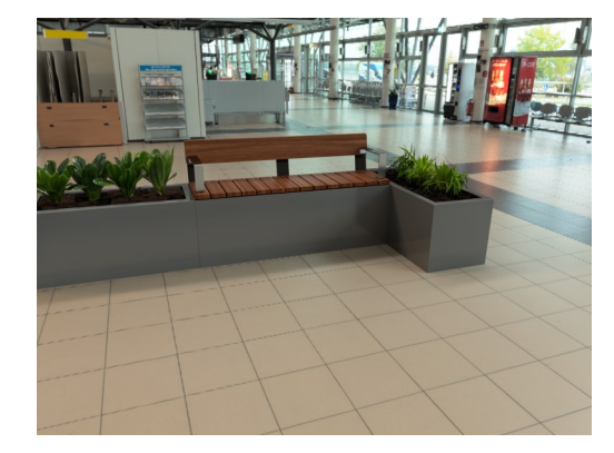
STG/181 Townscape Lite Seat x2 Townscape Mild Steel Planter