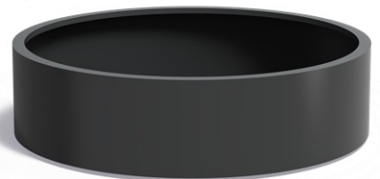
PLT/01961 1500 x 400