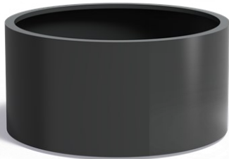
PLT/01966 1200 x 600