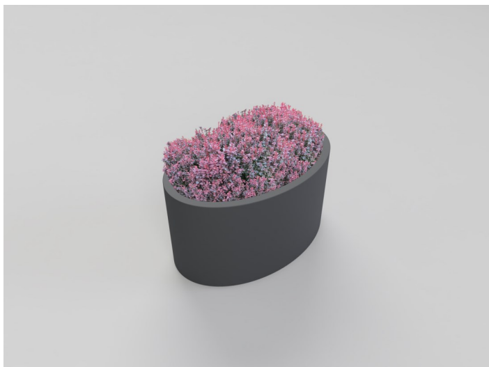
1200x800x617 Aluminium Planter Powder coated RAL7021 PLT01946