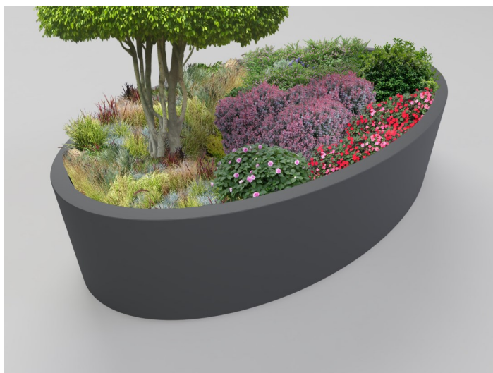
2800x1600x617 Aluminium Planter Powder coated RAL7021 PLT01947