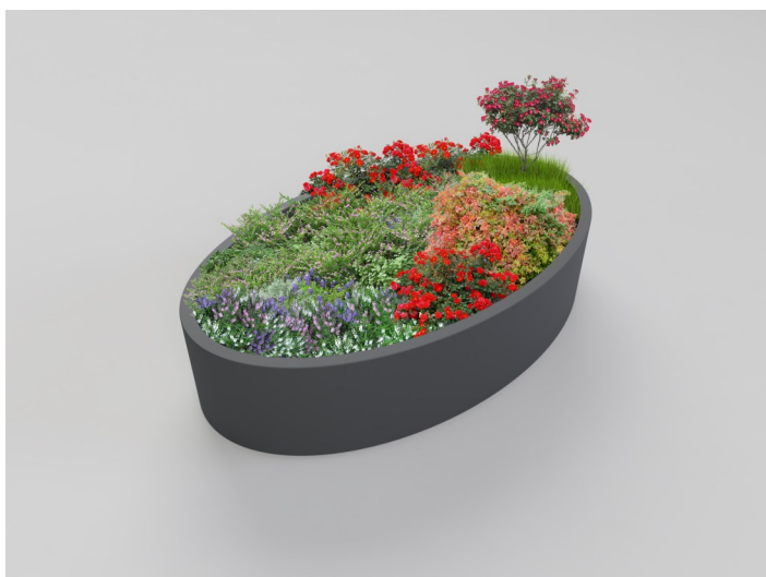
2000x1200x417 Aluminium Planter Powder coated RAL7021 PLT019410