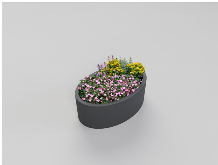
1200x800x600 Bottomless Aluminium Planter Powder coated RAL7021 PLT01948