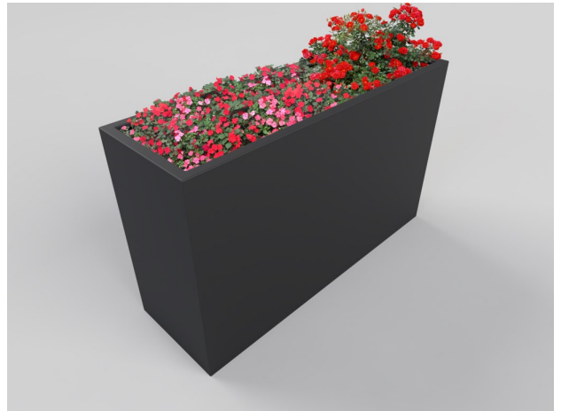
VED/0500A Aluminium Planter 1945x600x1100 RAL9005