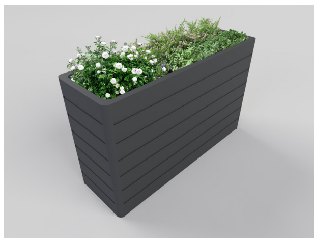
VED/0500SSP Powder Coated Stainless Steel Planter 1945x600x1100 RAL7021