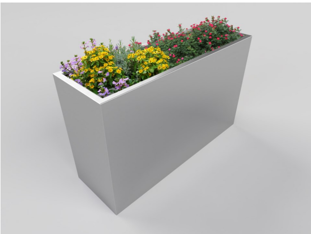
VED/0500SS Brushed Stainless Steel Planter 1945x600x1100