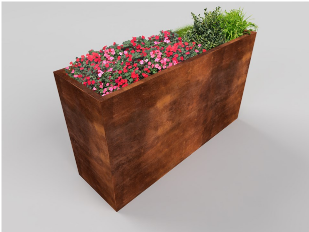
VED/0500C Corten Steel Planter 1945x600x1100