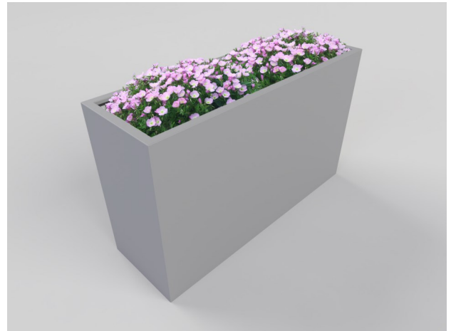
VED/0500MS Mild Steel Planter 1945x600x1100 RAL7001